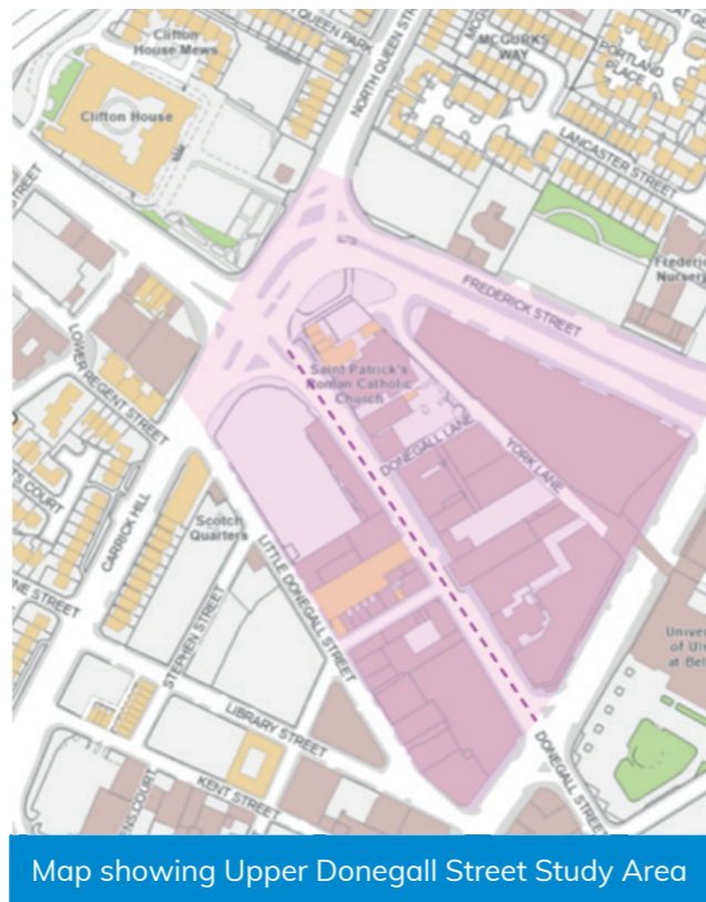
Map showing Upper Donegall Street Study Area

The Upper Donegall Street area is a key gateway to the City Centre and North Belfast; it will be a thriving and sustainable commercial thoroughfare embracing its uniqueness and celebrating its history and heritage buildings. It will provide homes along with dedicated community and green spaces.